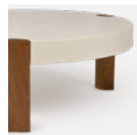
WHITE & OAK