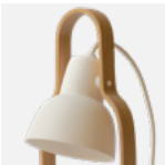
WHITE & OAK