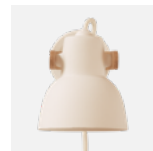
WHITE & OAK