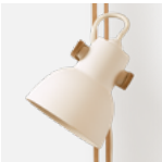
WHITE & OAK