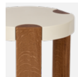
WHITE & OAK